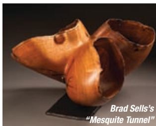
Brad Sells's "Mesquite Tunnel"