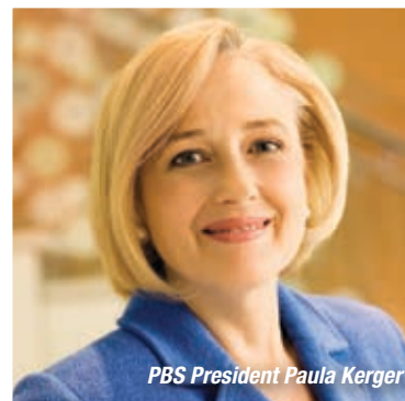
PBS President Paula Kerger

modest, the absence of this critical seed money would cripple the system and bring its services to an end.