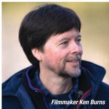
Filmmaker Ken Burns

Social media is a powerful force. When Governor Romney made the above statement, it sparked a firestorm of support for PBS on Twitter. The words "Big Bird" were tweeted 17,000 times a minute and "PBS" peaked at 10,000 tweets per minute. One of the Twitter handles, "@FiredBigBird," garnered 2000 followers in two minutes. One hour after the debate, that handle had 16,000 followers (ABC News).