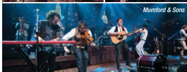
Mumford &amp; Sons