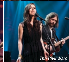
The Civil Wars