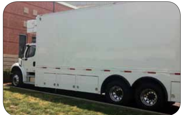
May 2012 — New HD Mobile production truck.