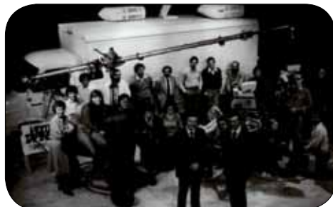
1979 — First mobile production truck.