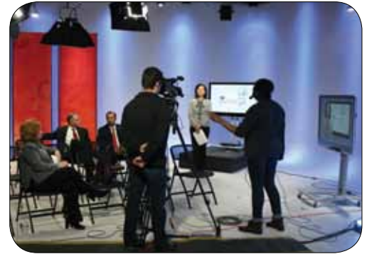
WKU PBS Studio One is the first PBS station in the country to use a new all LED lighting system.