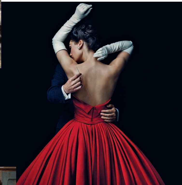
Lookout Point and MASTERPIECE