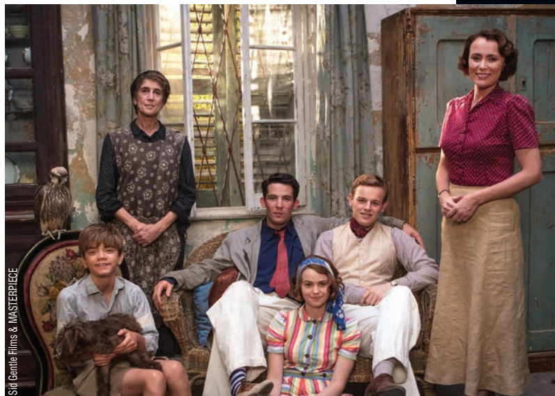
Sid Gentle Films & MASTERPIECE

Louisa Durrell (Keeley Hawes, Upstairs Downstairs ) and her four willful children return in the acclaimed series called "irresistible" ( The Wall Street Journal ) and "gorgeous" ( USA Today ). The second season continues to chronicle the family's adventures with the island's townspeople, customs and wildlife.