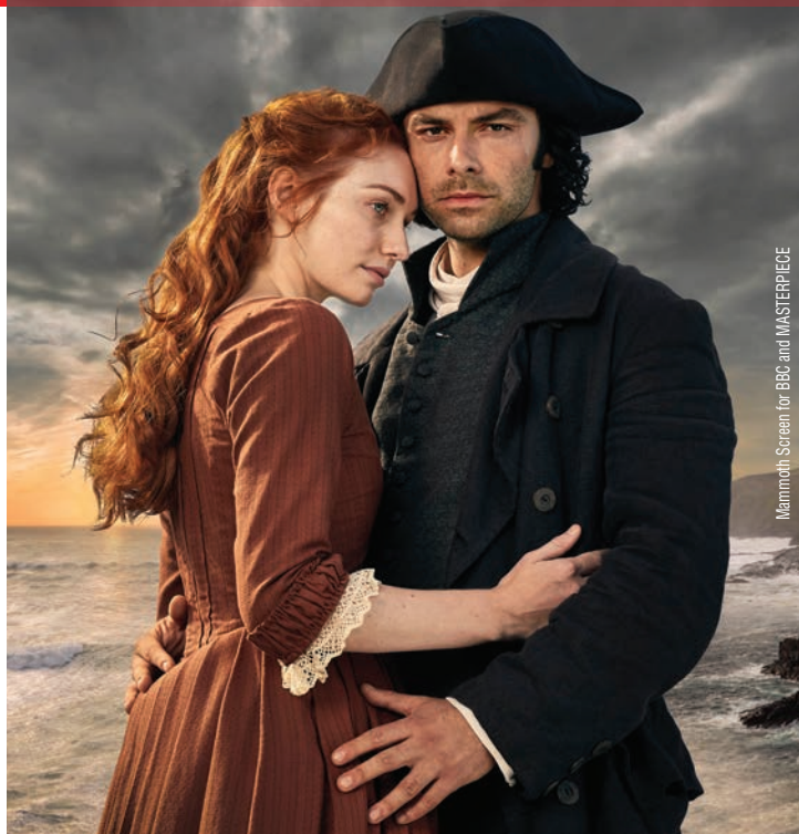
Mammoth Screen for BBC and MASTERPIECE